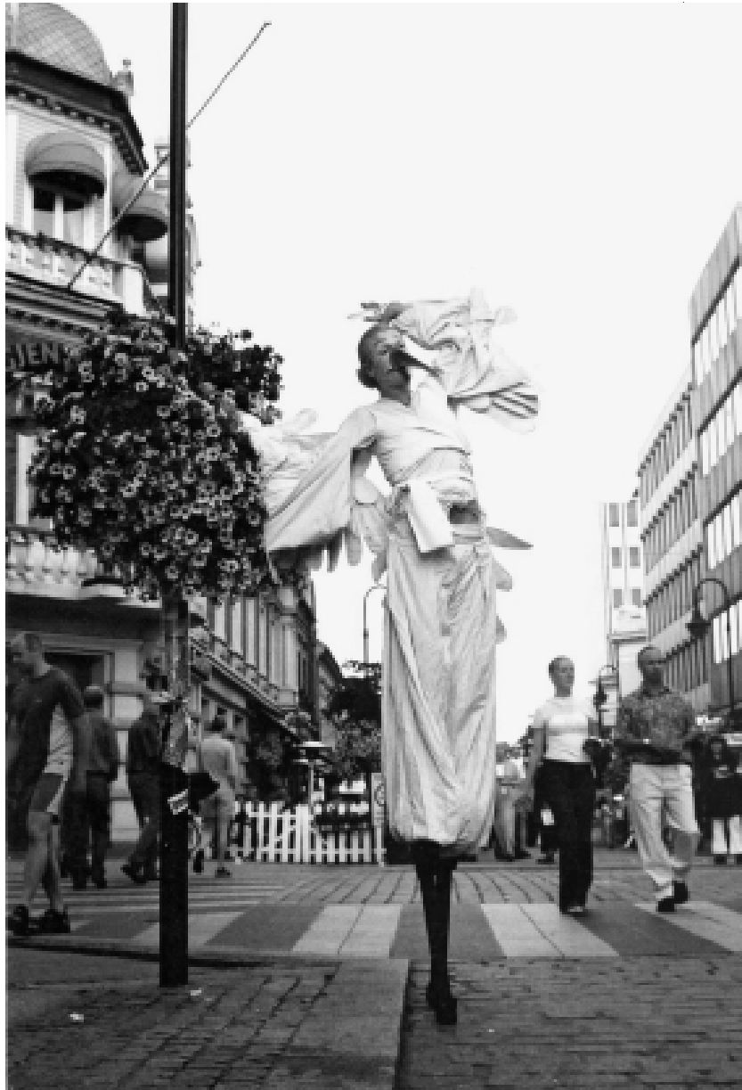
The Tricklock Theater Company in New Mexico received support for performances by the Norwegian theater company Gruvekompaniet in the annual Revolutions International Theater Festival .