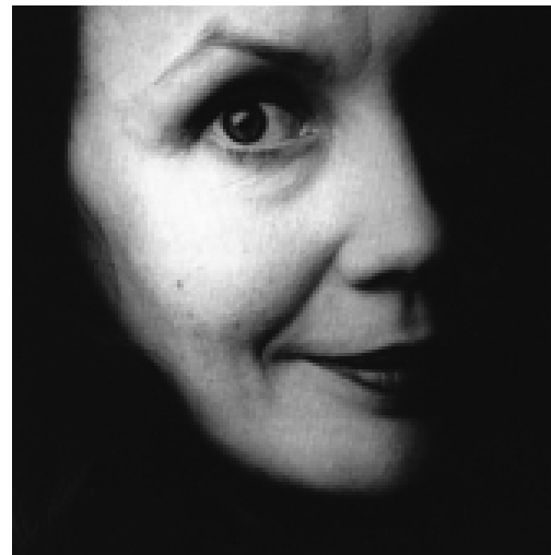
The Santa Fe Opera received support for its presentation of the American premiere of "L'amour de loin" by Finnish composer Kaija Saariaho.

in support of a multi-disciplinary festival of new art from Sweden, October 2002-April 2003. Thord-Gray Memorial Fund, $5,000.