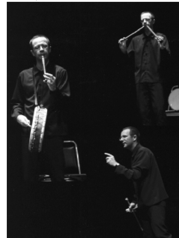
The Bloomington Early Music Festival received support for the participation of the Danish musical duet ESK in the 2003 festival.

Open Theatre/DC, Washington, DC in support of a production of August Strindberg's A Dream Play , utilizing a combination of Eastern and Western performance traditions, fall 2003. Thord-Gray Memorial Fund, $2,000.