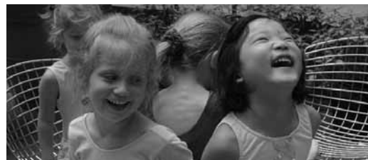
Children enjoy a program with dancers from The New York City Ballet

A Swedish Christmas Workshop for Kids December 2, 2006