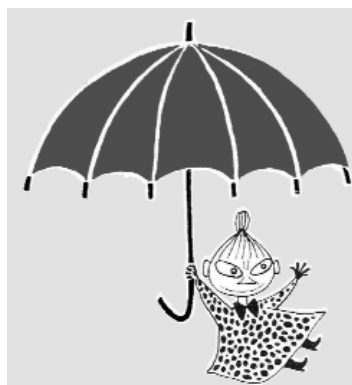
"Little My" illustration by Tove Jansson

The Cat Journey: Swedish theater company Peek-a-Boo (Dockteatern Tittut) November 1, 2005