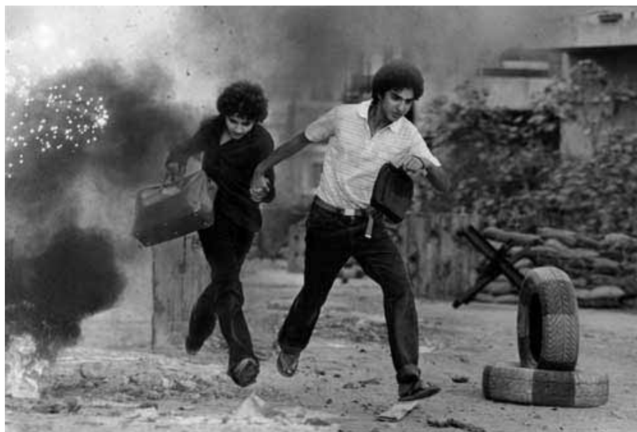
From the Swedish film Zozo , directed by Josef Fares