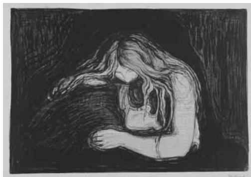
"Vampyr II" (1895-1902), Lithograph and woodcut by Edvard Munch from Edvard Munch: Symbolism in Print

Edvard Munch, the renowned Norwegian symbolist painter, is considered among the great printmakers of the modern period. This exhibition brought together 25 of the artist's most powerful compositions, vividly demonstrating his innovative creative process and unique artistic vision through etchings, lithography and woodcuts. All works were chosen from The Museum of Modern Art's collection of Prints and Illustrated Books.