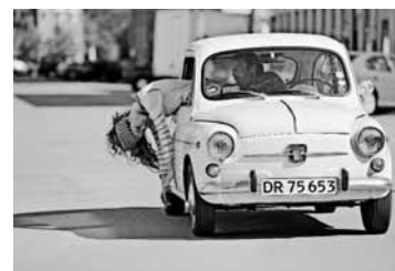
From the Icelandic film Dark Horse , directed by Dagur Kari

Ibsen on Film September 27-30, 2006 The Lion—Henrik Ibsen (American Premiere) (September 27), Terje Vigen (September 28), Lady Inger of Østråt/Fru Inger til Østråt (September 29), The Wild Duck/Vildanden (September 30), An Enemy of the People/En folkefiende (September 30)