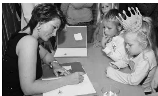
Princess Märtha Louise of Norway signing her book, Why Kings and Queens Don't Wear Crowns .