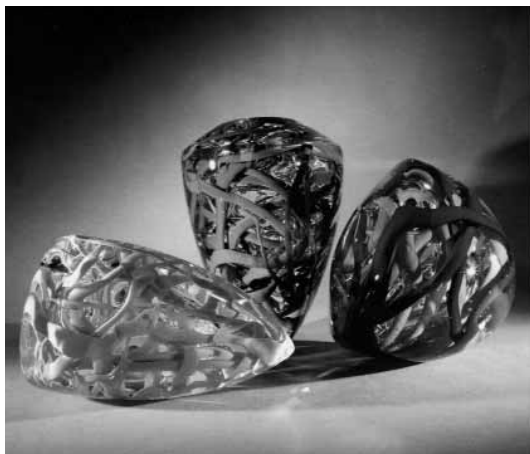
"Nest" (1999) by Kari Håkonsen from Breakable Art: Contemporary Glass and Ceramics from Norway

This exhibition featured original vintage prints of portraits from Garbo's private collection taken by some of the greatest photographers of the era, as well as posters, lobby placards, magazines and other memorabilia, and celebrated the centennial of the actress's birth on September 18, 1905. A companion film series, Forever Garbo , was presented at Scandinavia House in conjunction with the exhibition. Garbo's Garbos was organized by the Santa Barbara Museum of Art.