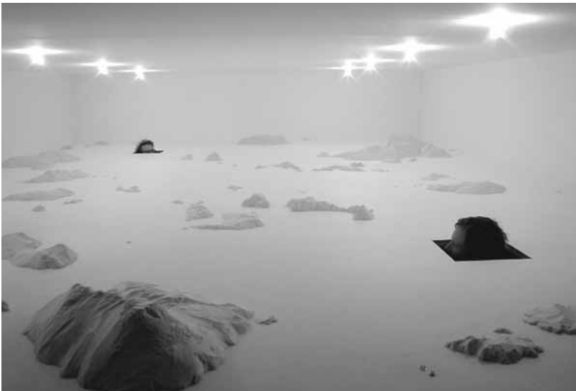
P.S. 1 received a grant in support of the High Plane installation by Icelandic artist Katrín Sigurdardóttir,