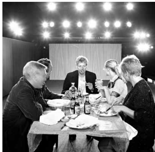
The Brooklyn Academy of Music received support for a production of Ibsen's The Wild Duck by the National Theater of Norway.

Bergen Youth Chamber Orchestra , Bergen, Norway A New York City concert tour featuring the work of Edvard Grieg.