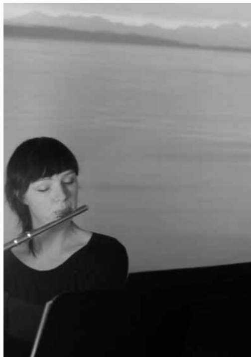
Adaptor , a music ensemble in Reykjavik, Iceland, received support for a performance by American composer Morton Feldman.

American Scandinavian Association of Augustana College , Rock Island, IL A performance by the winner of the Royal Swedish Opera School's Jenny Lind competition.