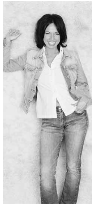
The International Rochester Jazz Festival received support for the participation of two Swedish jazz quartets in its 2006 summer festival.

Swiss Institute , New York, NY Performances by Swedish artists as part of the performance event 24-Hour Incidental .