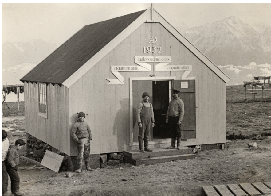
Kent's greatest gift to the people of Illorsuit was a dance hall that he built with their help during his final trip to Greenland in 1934-35.