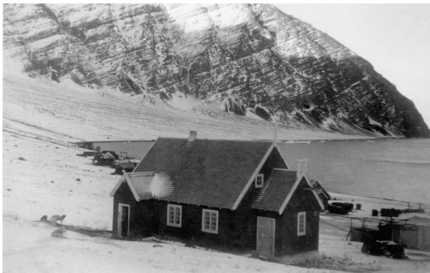
With building supplies from Denmark, Kent constructed a one-room house on a hill above Illorsuit's long, sandy beach.

Though they lacked a common tongue, Kent conveyed his plight through pantomime.