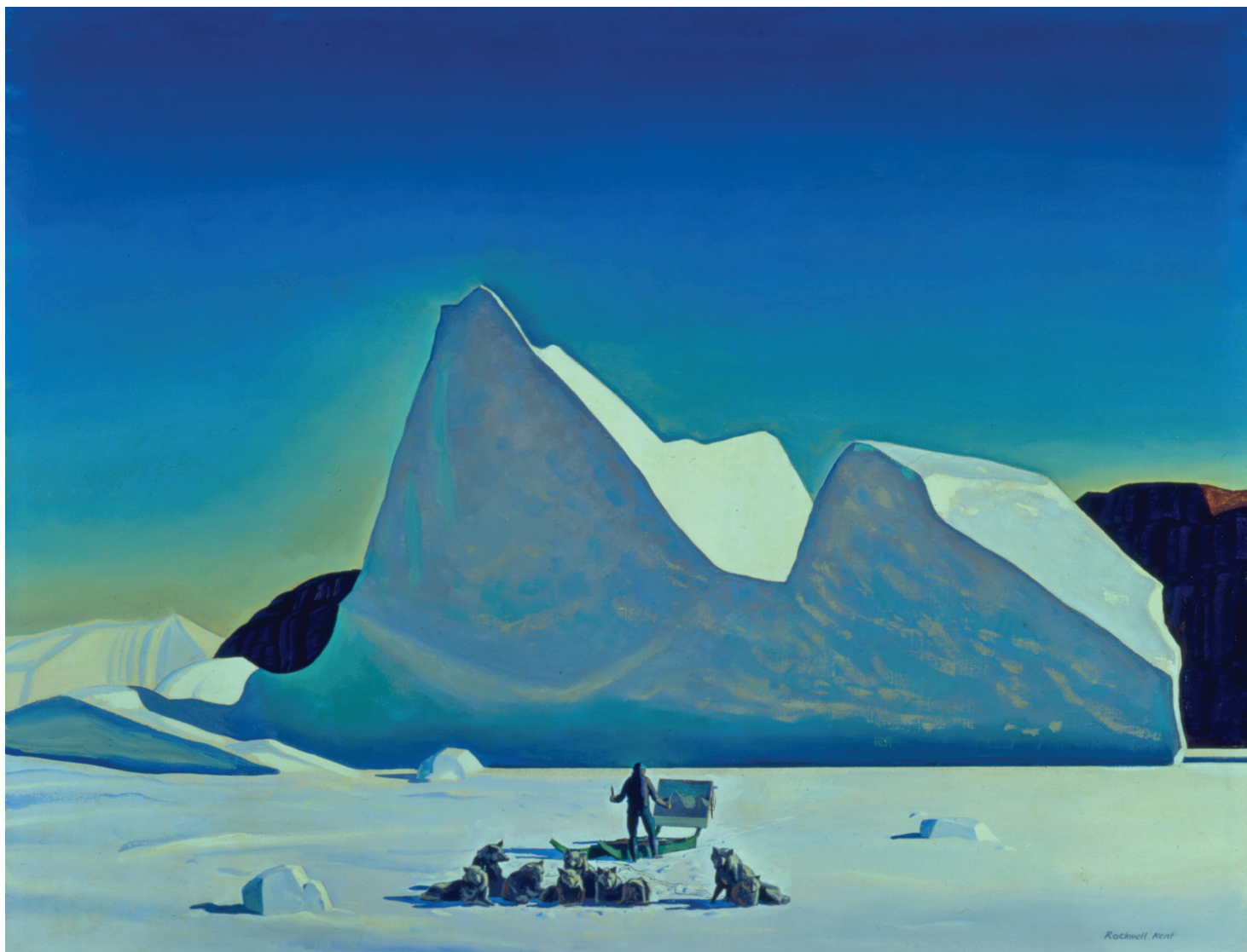
The Artist in Greenland , 1960.

hunting seal, just like the native hunters.”