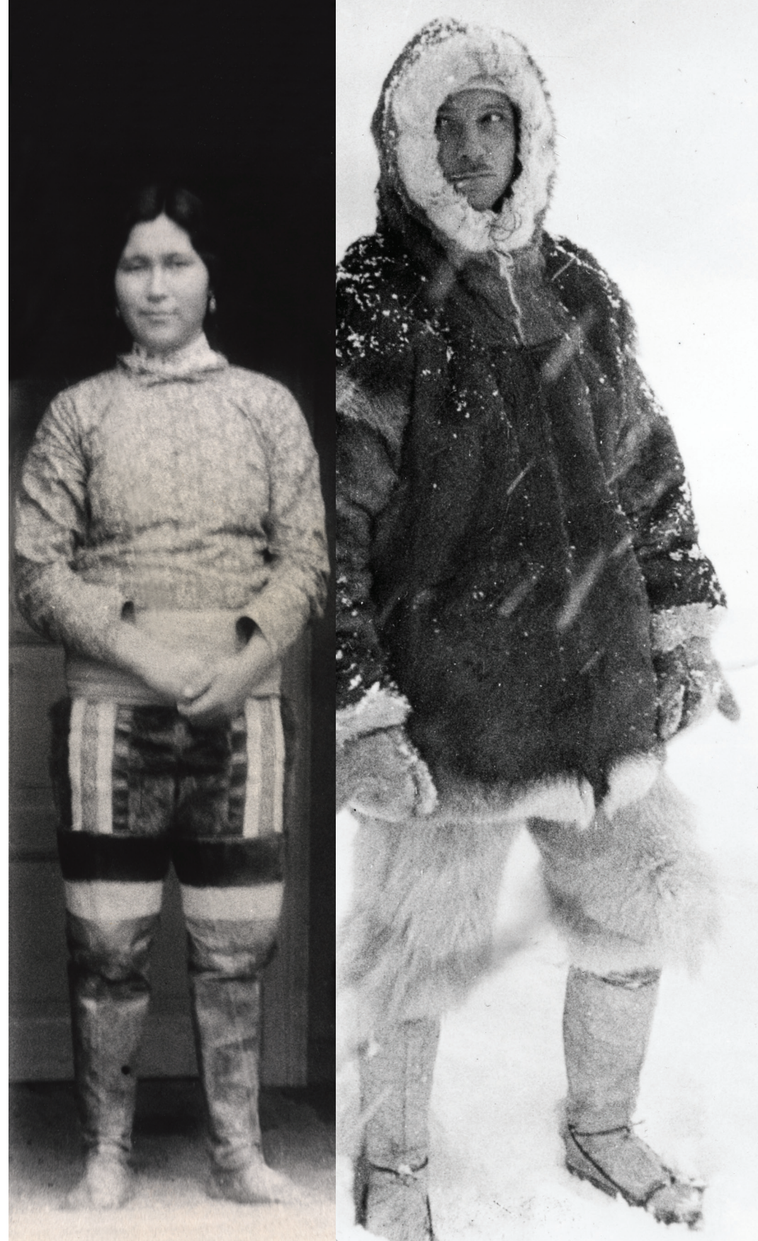
Opposite Page: Kent's housekeeper and mistress, Salamina, and Rockwell Kent, ca. 1935.