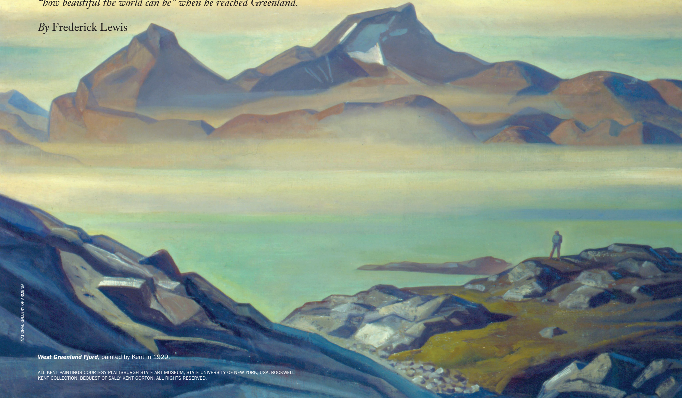
West Greenland Fjord , painted by Kent in 1929.

ALL KENT PAINTINGS COURTESY PLATTSBURGH STATE ART MUSEUM, STATE UNIVERSITY OF NEW YORK, USA, ROCKWELL KENT COLLECTION, BEQUEST OF SALLY KENT GORTON. ALL RIGHTS RESERVED.