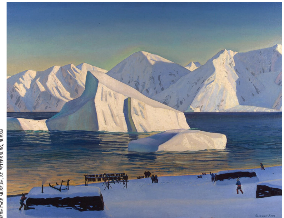
Early November: North Greenland, 1932.

Rockwell Kent's efforts to find his own role in this daily pageant were