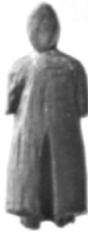
Thule Eskimo figure of a Norse "priest," from the travelling exhibition Vikings: The North Atlantic Saga

SMITHSONIAN NATIONAL MUSEUM OF NATURAL HISTORY