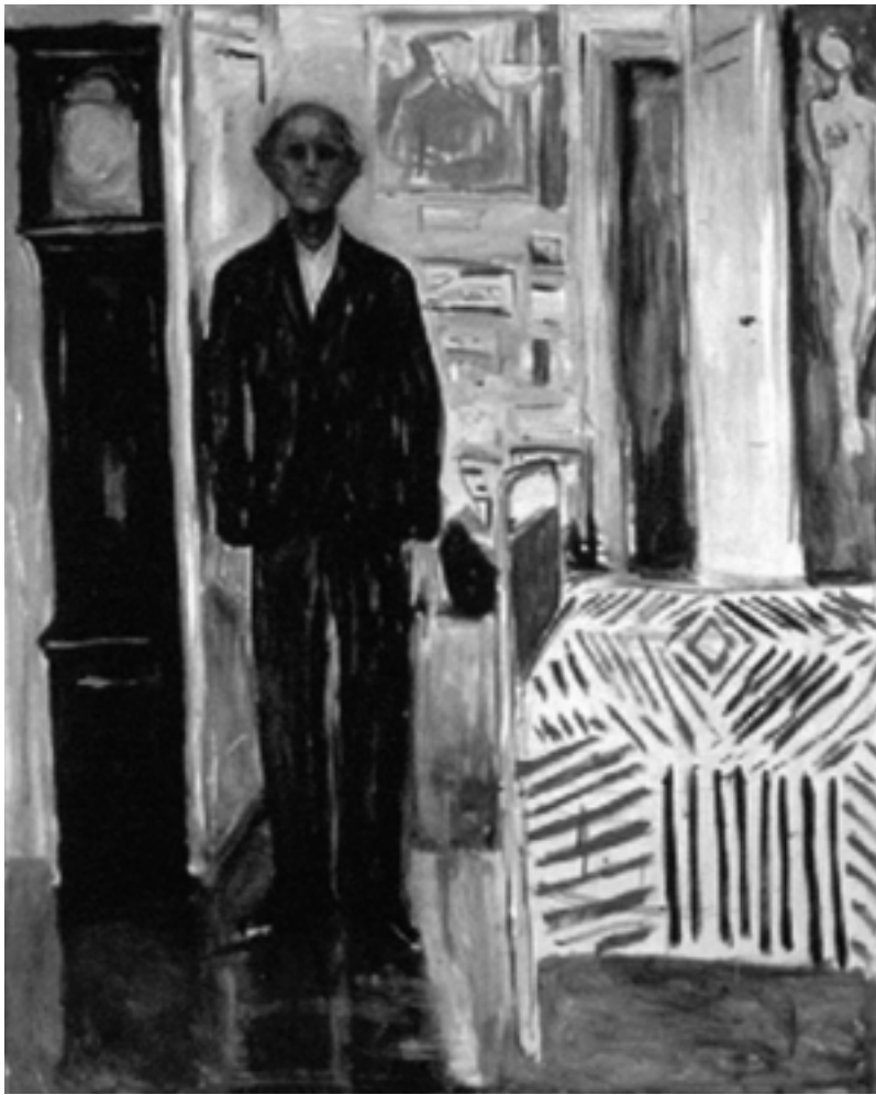
Self-Portrait Between the Clock and the Bed by Edvard Munch, from the exhibition After the Scream: The Late Work of Edvard Munch , High Museum of Art