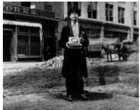
ZENTROPA REAL PRODUCTIONS

a grant supplementing a 1999 ASF award in support of the acquisition and restoration of two Icelandic books: an his-